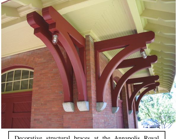
Decorative structural braces at the Annapolis Royal Train Station

By the 1980s, the DAR/CPR transferred operation of the Halifax-Yarmouth passenger service to VIA Rail, a Crown corporation. In January of 1990, federal government cuts to VIA Rail meant the end of the line for the Halifax-Yarmouth service. The last train stopped in Annapolis Royal in March of 1990. The track was taken up shortly afterward, and the train station was closed.