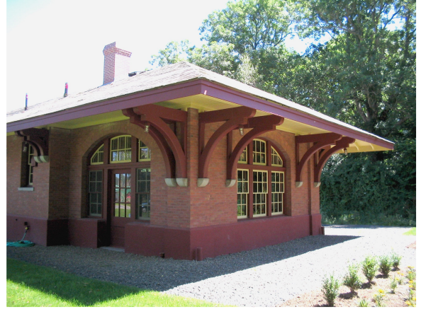
Northeast end of the Annapolis Royal train station after its restoration.

During the First and Second World Wars, the DAR played a critical regional transportation role, serving HMCS Cornwallis, RCAF Station Greenwood, RCAF Station Stanley and Aldershot Military Camp. Post-war, the DAR was an important mode of travel, but by the late 60s, with the advent of Highway 101 and new ferry terminals in Saint John and Digby that did not allow for rail-side transfers at the dock, passenger numbers declined.