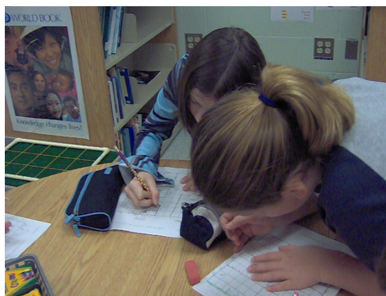
Two Students from Champlain Elementary School are shown graphing the artifacts that they have discovered in the Society's Archaeological Dig Boxes.