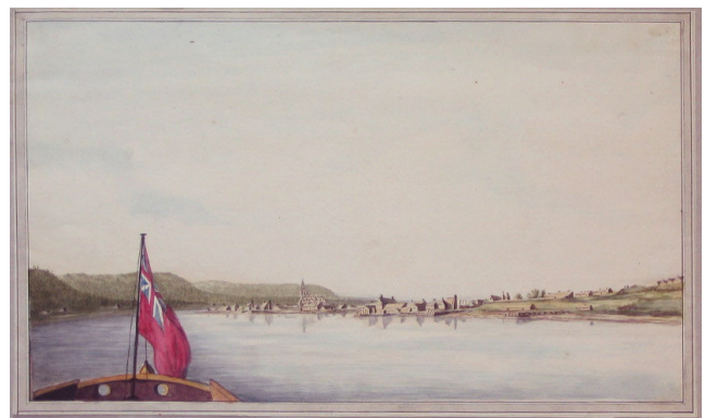
This image, one of the Williams paintings, shows the lower part of Annapolis Royal from the stern of the Empress of Russia.

The Annapolis Heritage Society is proud to have been part of the repatriation of these paintings. There are currently very few opportunities to add original source material to the body of information that is known about our community. We are very pleased that we have been able to help in bringing these important paintings to a publicly accessible collection in Nova Scotia.