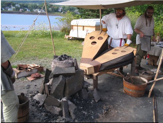
Viking re-enactors pumping the bellows during the iron smelting demonstration at the CanIron V blacksmithing conference. This part of the conference took place in the O'Dell House Museum parking lot

The success of this event demonstrates the beneficial partnership that exists between the Annapolis Heritage Society and the Annapolis Royal Historic Gardens. We were very pleased to be able to work cooperatively with the Historic Gardens on the House Tour. While the final numbers are still being tabulated, it appears that both the Annapolis Heritage Society and the Historic Gardens Society will make over $2500.00 from this event.