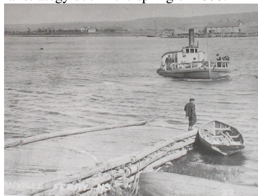
The Granville to Annapolis ferry landing at the Annapolis Royal ferry slip circa 1910.

This forum is the time to put forward a strong case about the importance of heritage in Nova Scotia. Organizations like the Annapolis Heritage Society provide important services to our communities, including educational programming, genealogical resources, artifact and